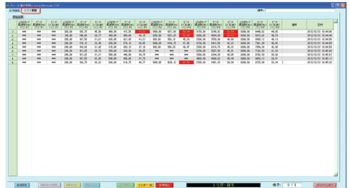
Tabulated Result Screen