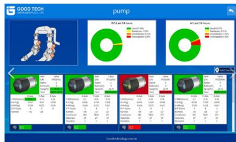
Spots and data of each sensor on the machine