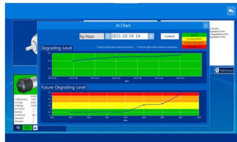
AI degradation trend