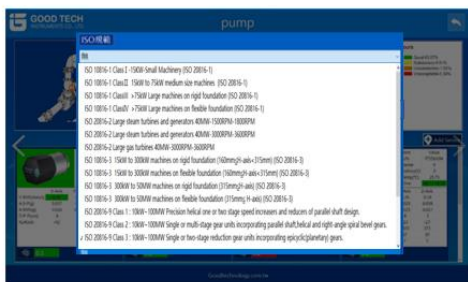
ISO10816 / 20816 / 2372 norms

In recent years, benefiting from the rapid development of IoT tech, each heavy-duty industry has been deploying a long-time, continuous monitoring system for machines' operational conditions. RM-IO-B is an online monitoring solution, based on IoT structure, meanwhile, integrating rotors vibration characteristics as well as regulation-based criteria.